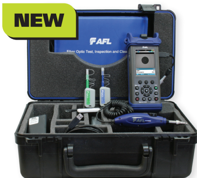
M210 QUAD Test and Inspection Kit (Tier 2)