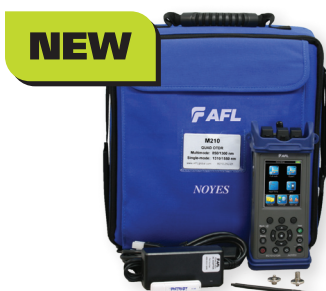
M210 OTDR in Soft Case