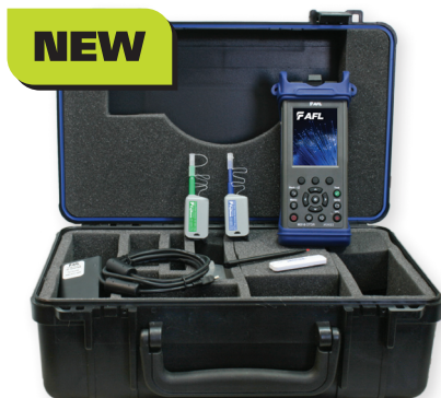
M210 OTDR in Hard Transit Case