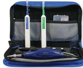
DFS1 FiberScope Inspection Kit