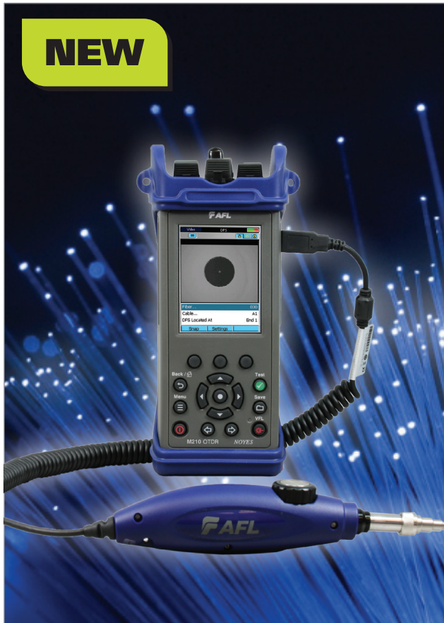
M210 OTDR with DFS1 Digital FiberScope

Test, Troubleshoot and Document Single-mode and Multimode Fiber Networks