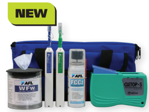
FCP2-00-0900 Basic Cleaning Kit