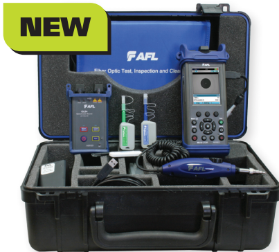
M210 QUAD Certification Kit (Tier 1 and Tier 2)