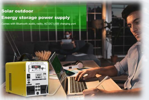
Solar outdoor Energy storage power supply Comes with Bluetooth audio, radio, AC/DC/USB charging port