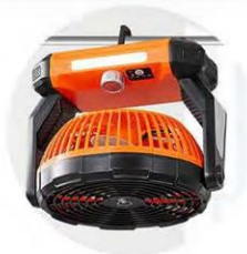
Use upside down