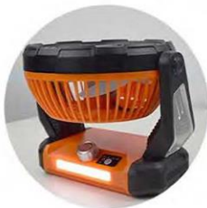
90 degree adjustment