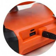
Emergency charging hole