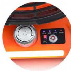
LED three-block light