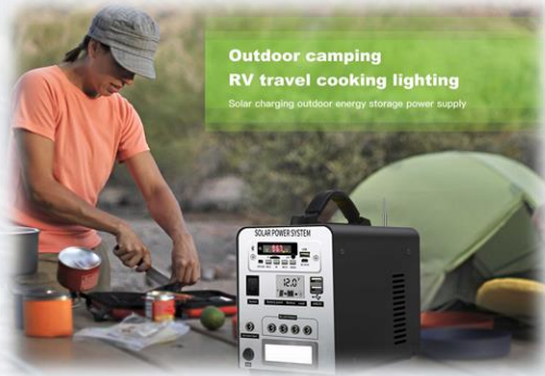
Outdoor camping RV travel cooking lighting Solar charging outdoor energy storage power supply