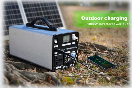
Outdoor charging 1000W inverter power supply